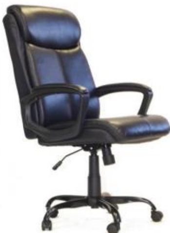
HARLEM HIGH BACK