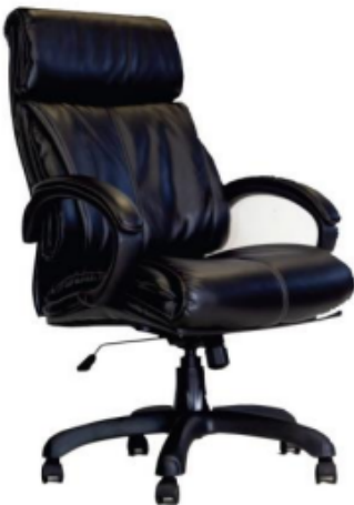
Mr Chairman HighBack