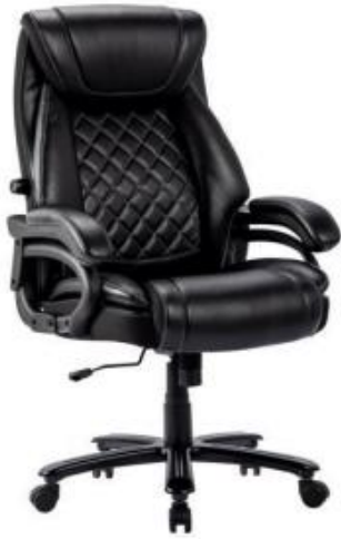
LIMO HIGH BACK